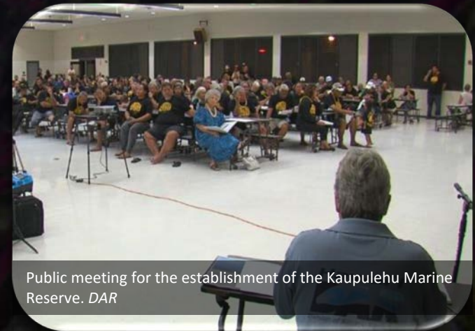
Public meeting for the establishment of the Kaupulehu Marine Reserve.