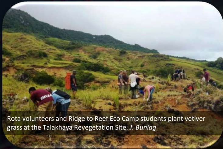
Rota volunteers and Ridge to Reef Eco Camp students plant vetiver grass at the Talakhaya Revegetation Site. J. Buniag