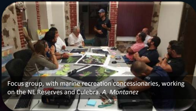
Focus group, with marine recreation concessionaries, working on the NE Reserves and Culebra.